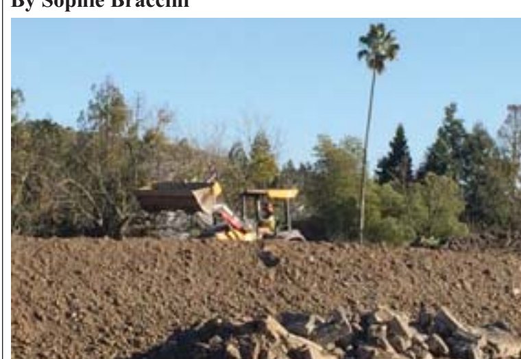
KB Homes grades the future site for the Moraga Center Homes.